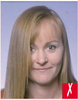
hair across eyes