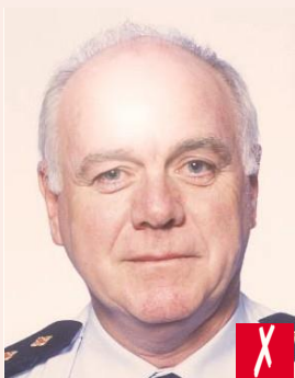
flash reflection on skin