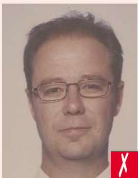
washed out colour