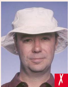
wearing a hat