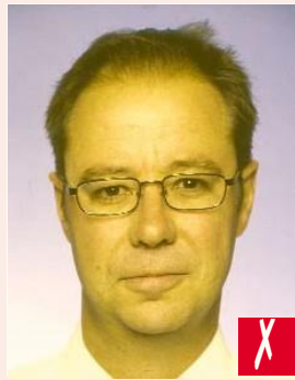
unnatural skin tones