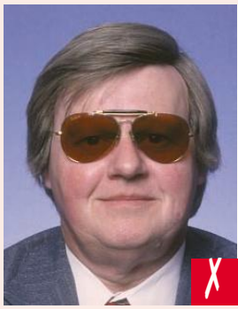
dark tinted lenses