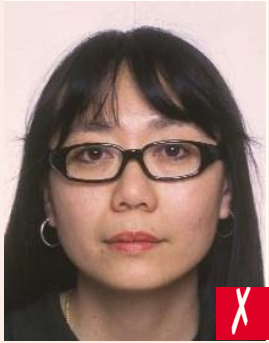
frames too heavy