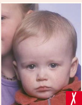
shows another person