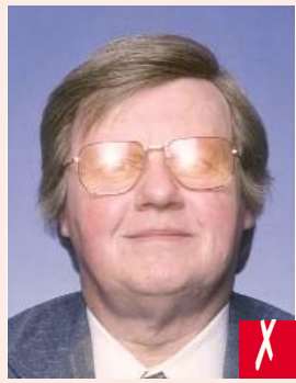
flash reflection on lenses