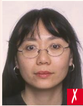
frames covering eyes