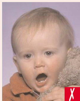
mouth open and toy too close to face