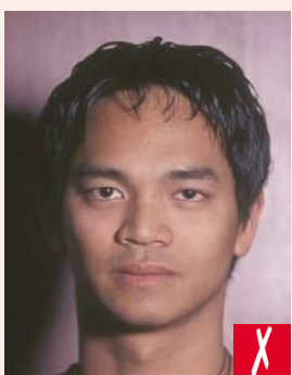
shadows behind head