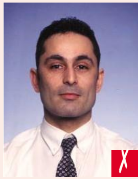
too far away